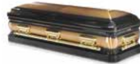
El Dorado 68-69