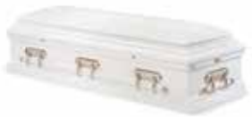
Heavenly White 50-51