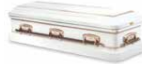
White Rose 58-59