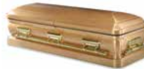
Majestic Gold 70-71