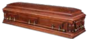
Ashby Poplar 54-55